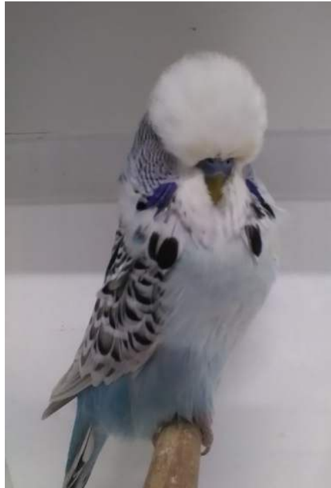
Lot 5 — WH1-22-297

The Phil Hoadley Estate Budgerigar Auction will be run in Compliance with all Conditions and Policies which include but are not limited to the following: