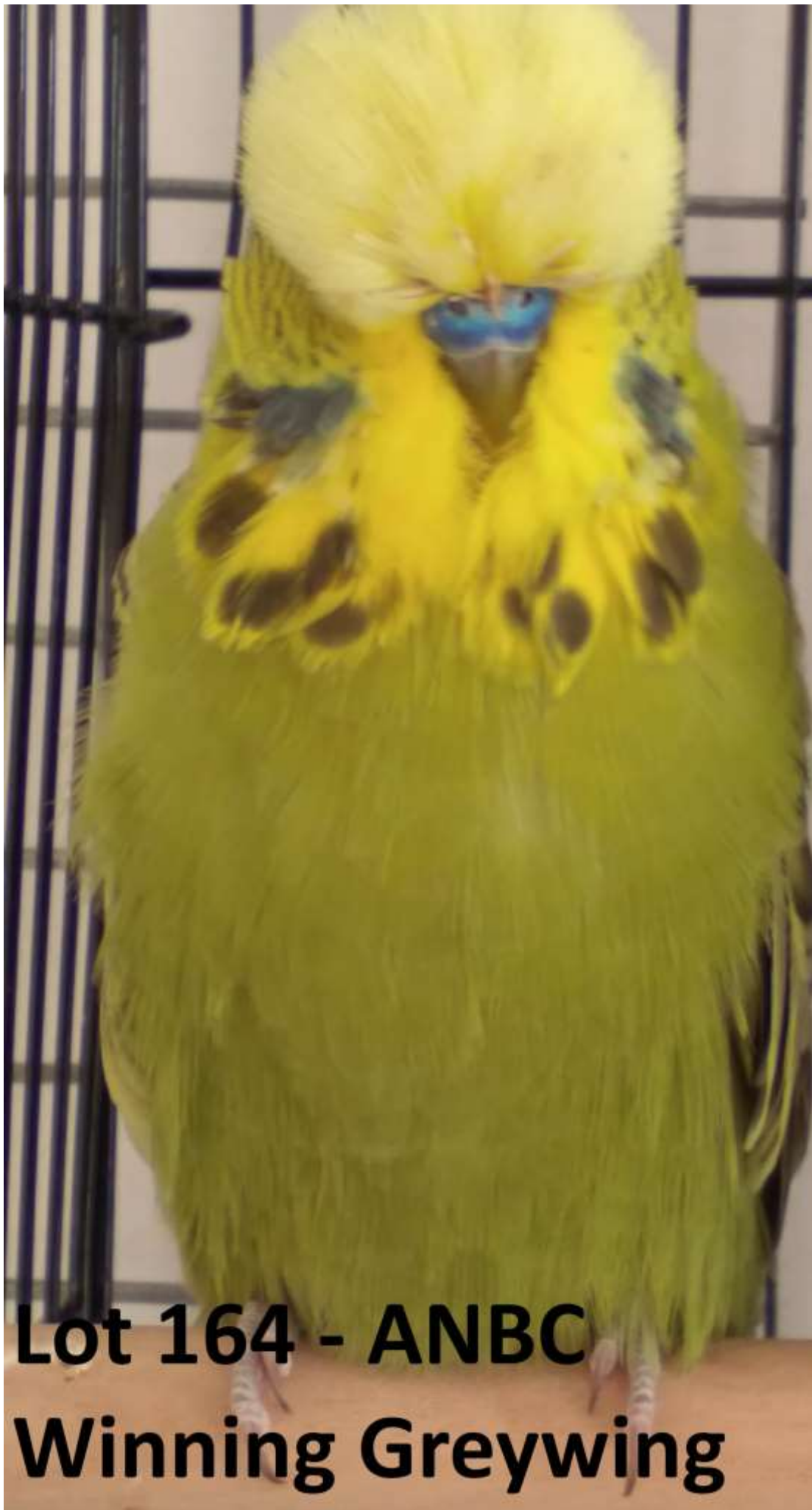
Lot 164 - ANBC Winning Greywing