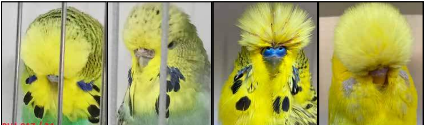
Hewitt Lot 119 Hewitt Lot 120 Weidenhofer Lot 121 Weidenhofer Lot 122