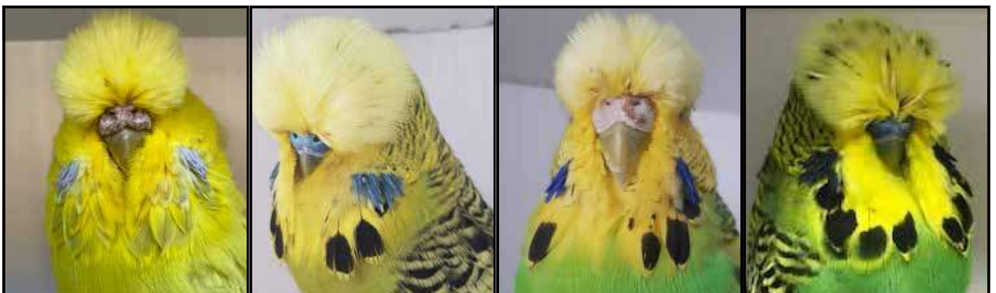
Weidenhofer Lot 78 Wheatley Lot 79 Wheatley Lot 80 Schiller Lot 81