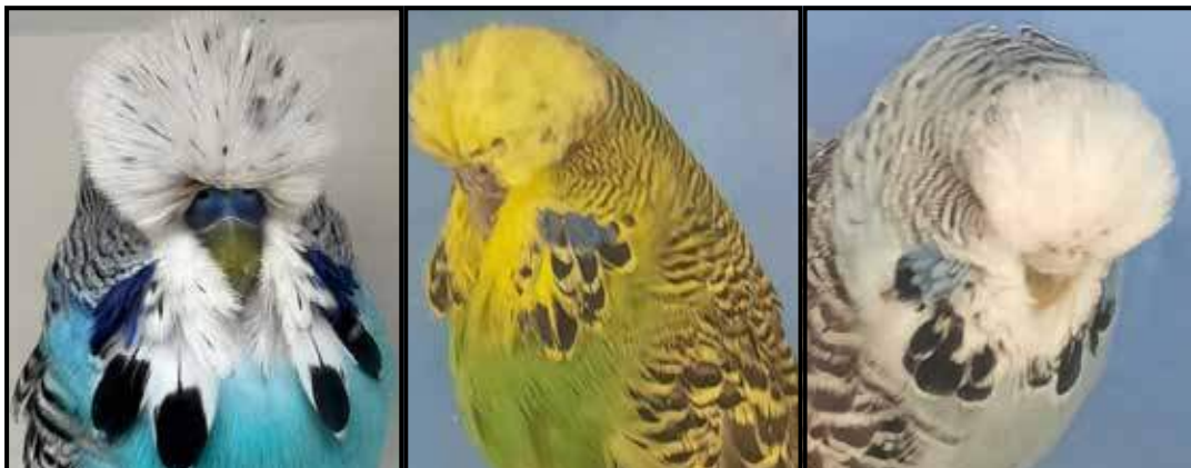
Buckingham Lot 109 Boss Lot 110 Boss Lot 111