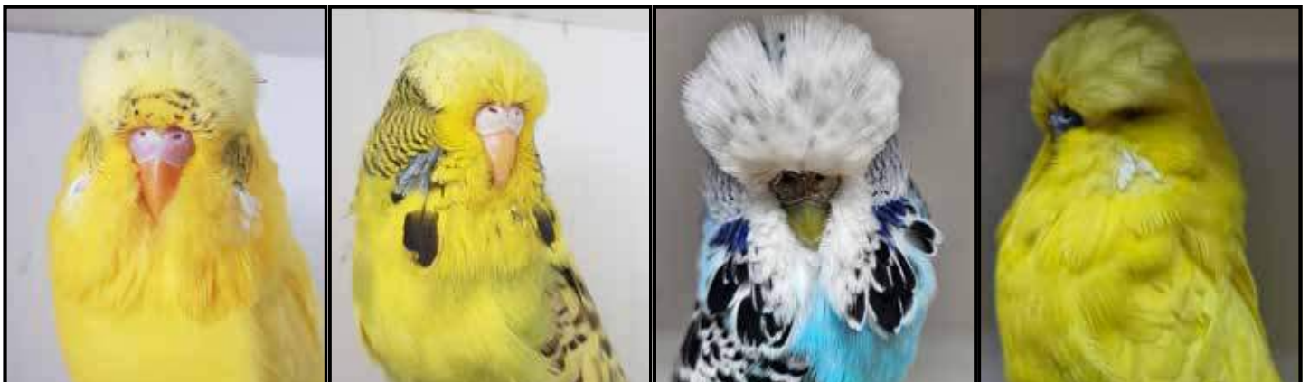
Wheatley Lot 123 Wheatley Lot 124 Barden Lot 127 Barden Lot 128