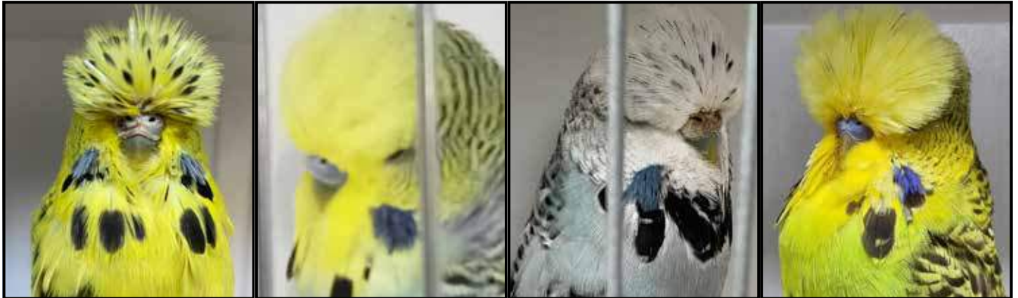
Weidenhofer Lot 142 Hewitt Lot 143 Ennis Lot 146 Boal Family Lot 148