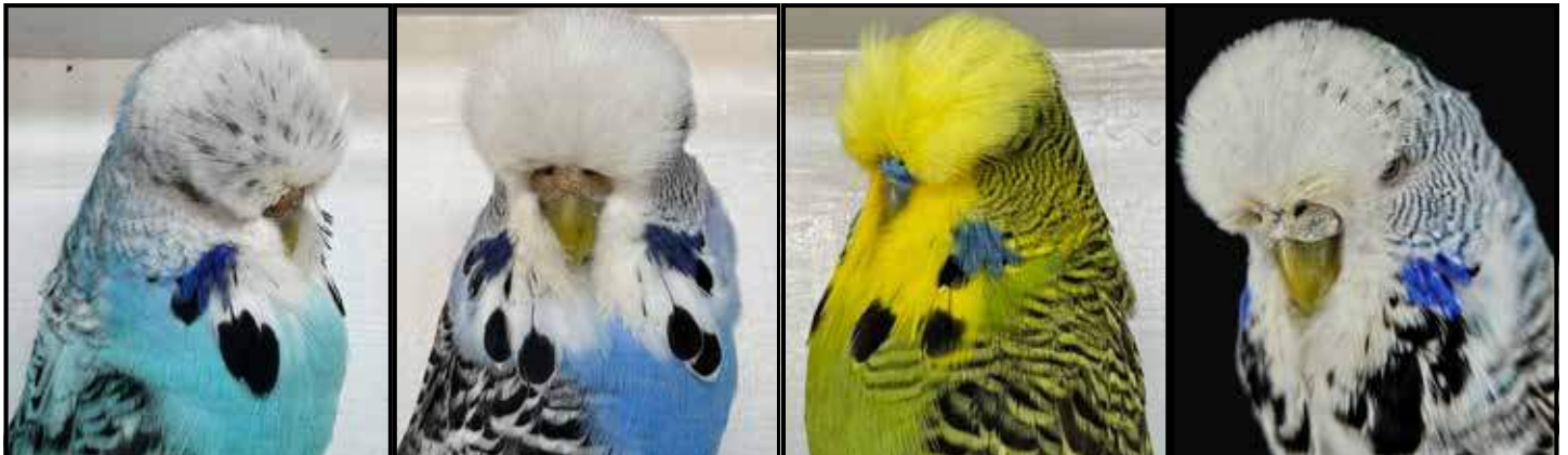
Gearing Lot 28 Gearing Lot 29 Gearing Lot 30 Tipping Lot 31