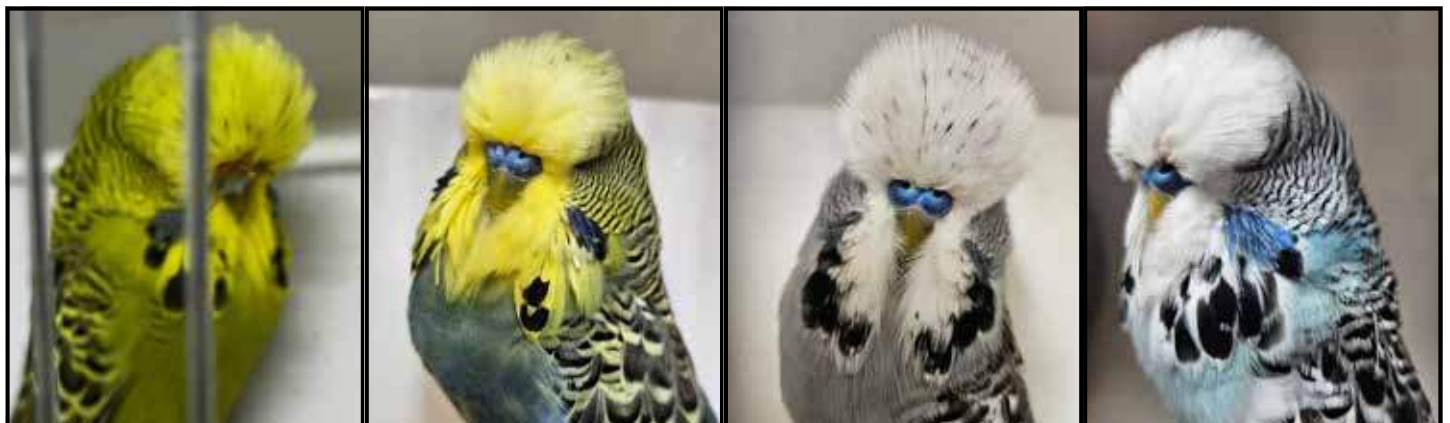
Starcevic Lot 6 Child Lot 7 Barden Lot 8 Barden Lot 9