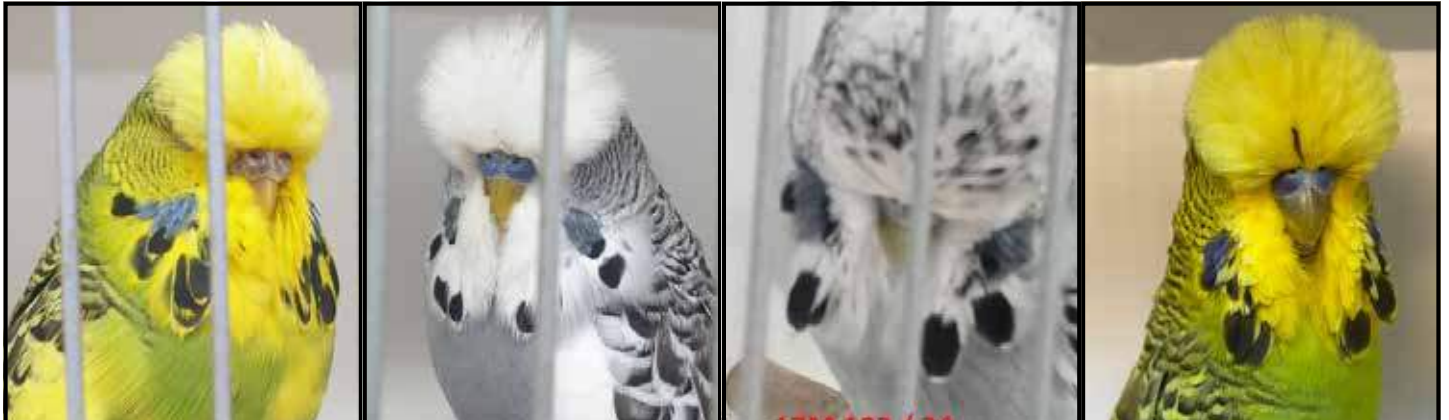
Leong Lot 74 Leong Lot 75 Matthews Lot 76 Weidenhofer Lot 77