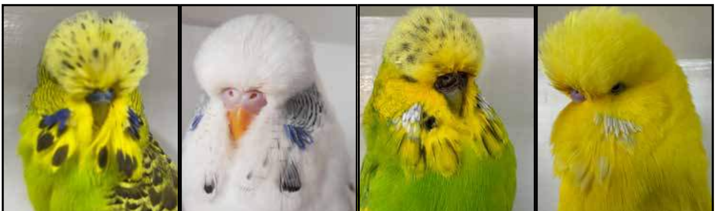
Kamel Lot 44 Wheatley Lot 46 Gearing Lot 48 Gearing Lot 49