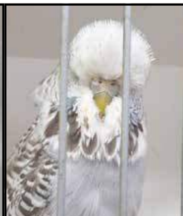
Holmes Family Lot 116 Kamel Lot 117 Leong Lot 118