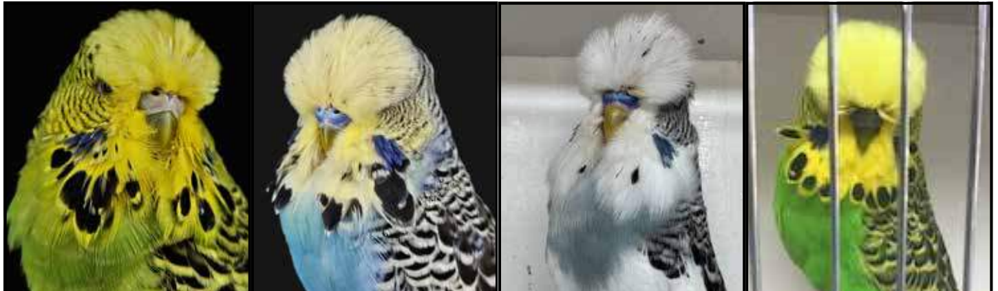
Tipping Lot 1 Tipping Lot 2 Gearing Lot 4 Schiller Lot 5