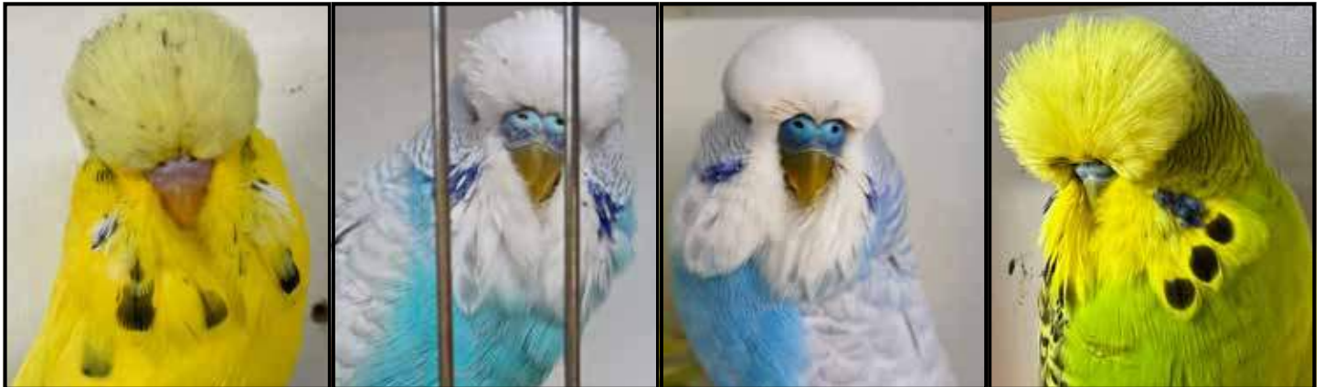
Capasso Lot 40 Manton Lot 41 Manton Lot 42 Holmes Family Lot 43