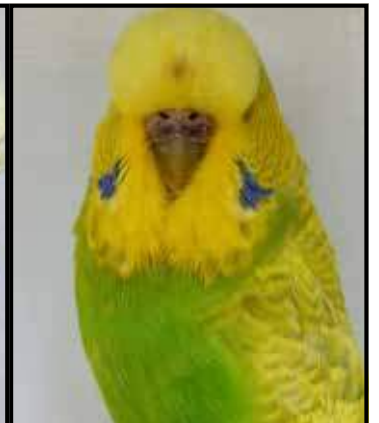
Capasso Lot 112 Capasso Lot 113 Manton Lot 114 Manton Lot 115