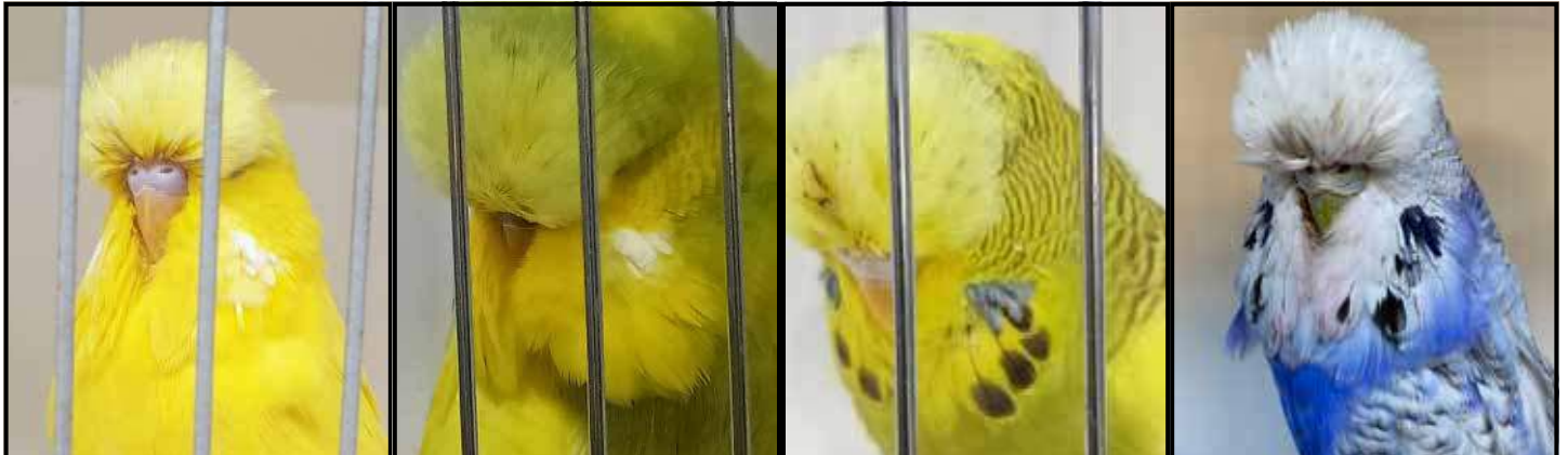
Leong Lot 20 Matthews Lot 21 Matthews Lot 22 Weidenhofer Lot 23