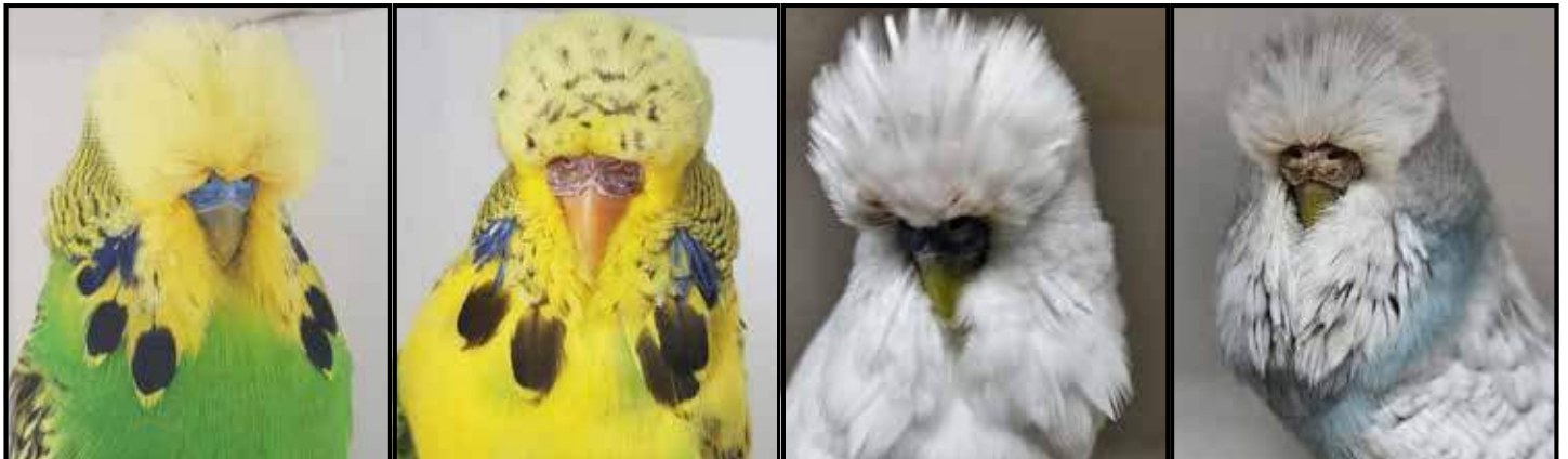
Wheatley Lot 24 Wheatley Lot 25 Barden Lot 26 Barden Lot 27