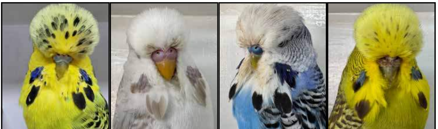
Boal Family Lot 149 Gearing Lot 150 Gearing Lot 151 Gearing Lot 152